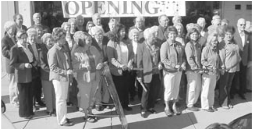
A Grand Opening for the Hickory Grove Mercantile store was held on Friday, September 30th. The new store is located on the south end of the current Rudolph's, Inc. store in the North 100 Block of State Street.